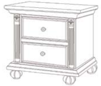
NIGHTSTAND 26" W x 18" D x 25 1/4" H