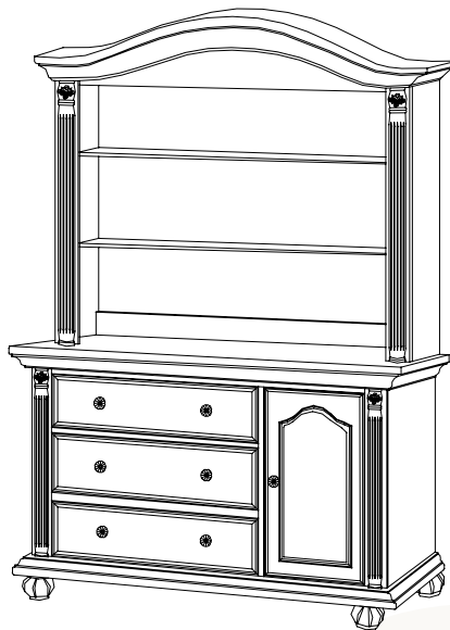
DRESSING STATION 60" W x 20" D x 34" H