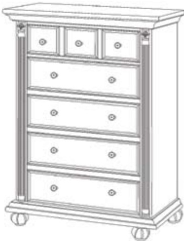
5 DRAWER DRESSER 44 1/4" W x 20" D x 51 3/4" H