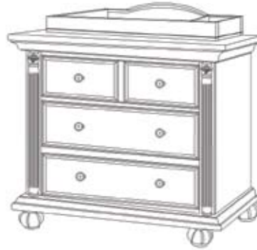
3 DRAWER DRESSER 44" W x 20" D x 34" H