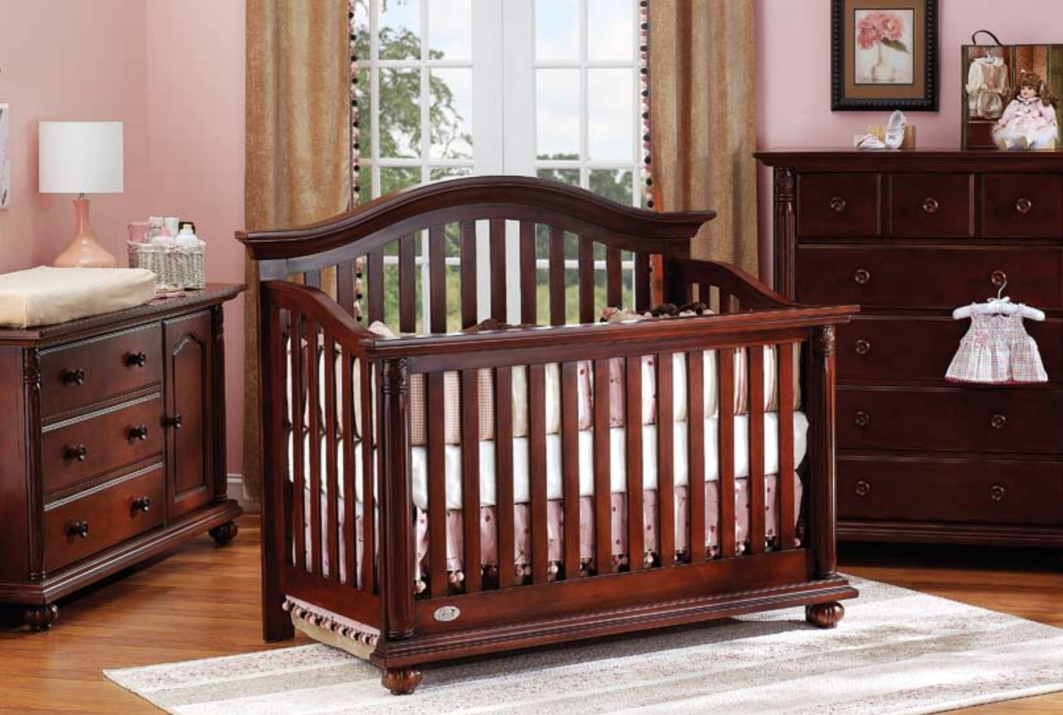
1000 series is a classically styled heirloom collection. The convertible crib will transition to day-bed and full-size adult bed. Crib, Dressing Station, 5-drawer, and nightstand shown in Paprika.